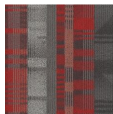
Crimson Rope 23555 LRV 13.7