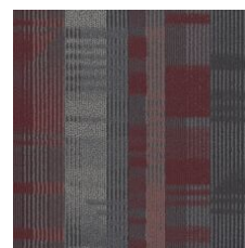
Pigment Beam 23580 LRV 7.9