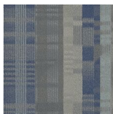
Cyan Chrome 23515 LRV 22.2