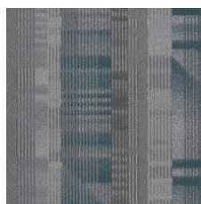
Glass Concrete 23535 LRV 15.9