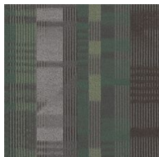
Verdure Metal 23585 LRV 8